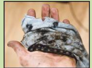
Oil soaked Cotton Waste