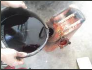
Used & waste industrial / automotive oils