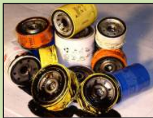
Used & Drained Oil / Fuel Filters